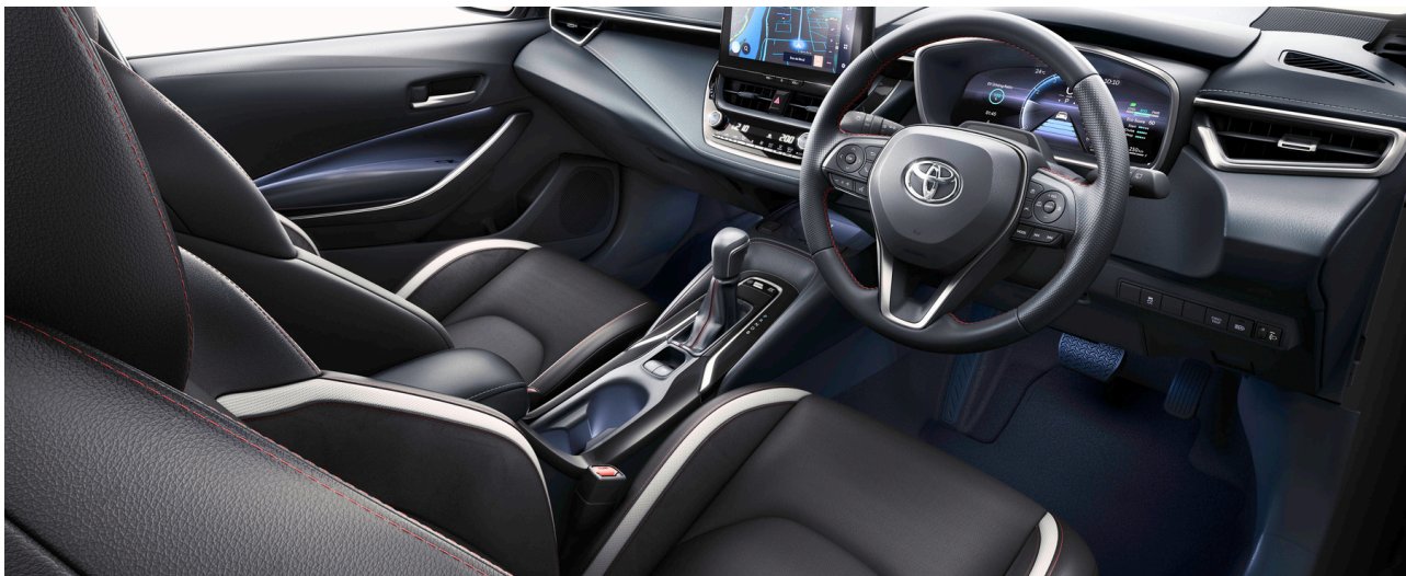
Grey fabric with black leather-like bolsters & satin chrome ornament (FC21) (GR SPORT)