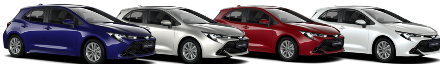
Juniper Blue (8Y8)