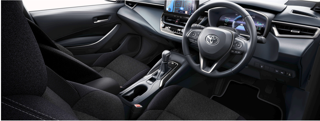
Dark Grey fabric (FD21) (Luna)