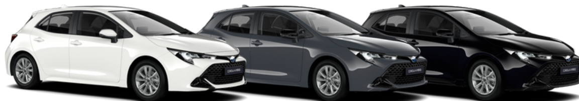
Pure White (040)