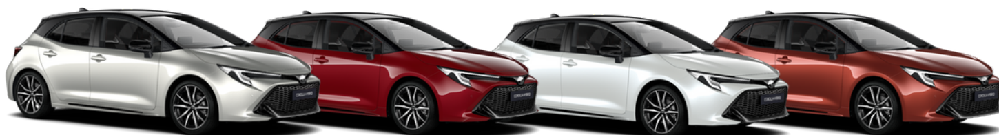
Precious Silver Bi-tone (2RD) (Pearlescent)