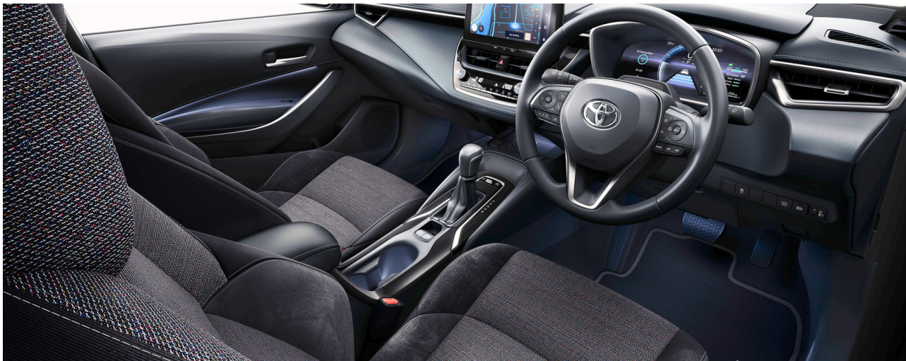
Recycled Fabric Samara & Dinamica (EB21) (Luna Sport)