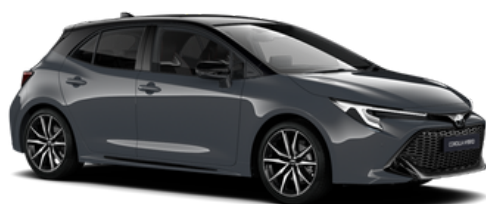
Storm Grey Bi-tone (M52)