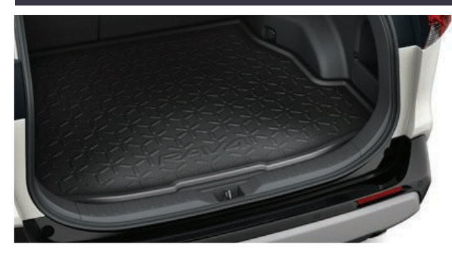
BOOT LINER Tailored to fit the boot of your vehicle and provide protection against dirt and spills.