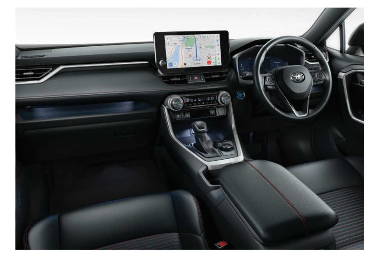
Black Synthetic Leather Upholstery with red stitching(Sol) Black Synthetic Leather Upholstery with red stitching (Sport) Full black Synthetic Leather Upholstery with silver stitching (GR SPORT)